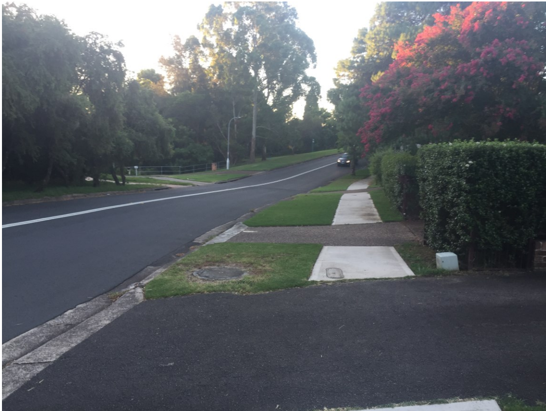
Photograph taken on Middleton Avenue standing at the location of proposed Cadman Crescent extension. Drivers turning right onto Middleton Avenue will have difficulty seeing cars coming round the bend.

There is not sufficient evidence in the Precinct Plan to indicate that site visits were carried out to investigate the physical site limitations of the locations of these new proposed roads. The location of the proposed new local road extending Cadman Crescent to connect Hughes Avenue and Middleton Avenue does not take into consideration the topography of the existing site. The existing curve and dip of the road has created an existing blind spot at the bend and it would be dangerous to place a new road at this location.