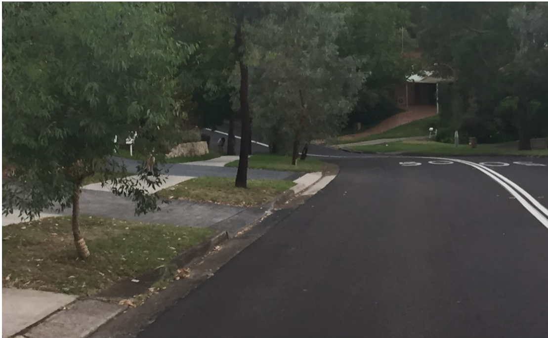
Approach along Middleton Avenue, highlighting blind spot area for drivers coming out of the proposed Cadman Crescent connection. This new road will not be visible to drivers coming along Middleton Avenue until they are only metres away from the new road.

The proposed road extending Ashford Avenue to create a connection between Middleton Avenue and Hughes Avenue is in a safer location due to existing sight lines that provide good visibility and would take advantage of the existing roundabout at the intersection of Ashford Avenue and Middleton Avenue.