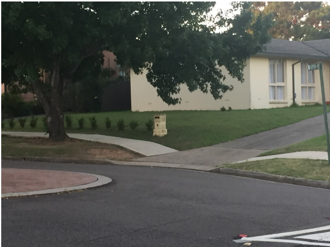
Existing roundabout at Ashford Avenue

The proposed road extending Ashford Avenue to create a connection between Middleton Avenue and Hughes Avenue is in a safer location due to existing sight lines that provide good visibility and would take advantage of the existing roundabout at the intersection of Ashford Avenue and Middleton Avenue.